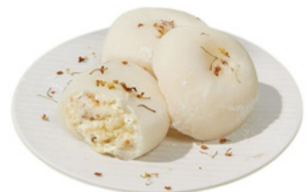
Osmanthus Rice Wine