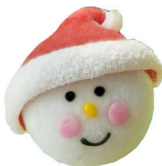
Santa Claus (Strawberry Cheese)