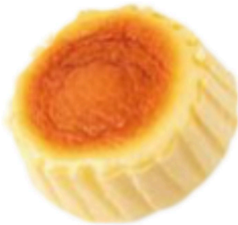
Original 60g / 90g

Originating from the Basque region of Spain, this classic dessert is known for its signature “burnt” finish and indulgent texture. Each bite offers a dense yet velvety mouthfeel, making it a premium choice for both retail and foodservice applications.