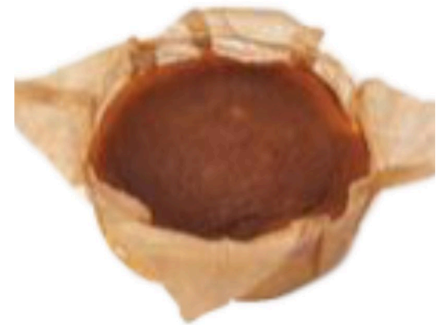
Durian 60g / 90g

Crafted using a high-temperature, short-time baking technique, our Basque Burnt Cheesecake features a beautifully caramelized surface with a rich, burnt aroma, while maintaining a soft, creamy, and smooth interior.