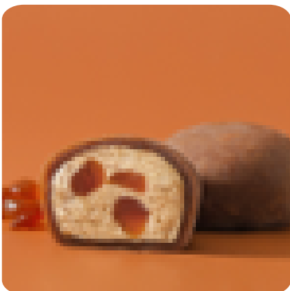
Brown Sugar Boba