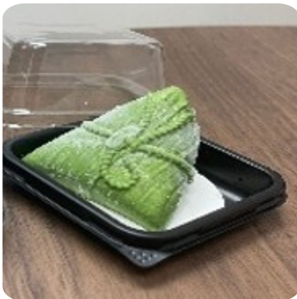
Dumpling Matcha Azuki