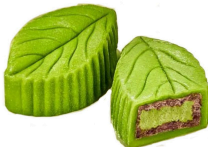
Leaf (Matcha Azuki)