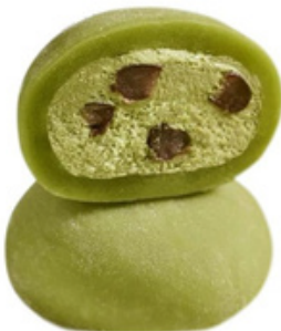
Matcha Red Bean