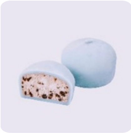
Sea Salt Cheese